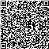
QR code to Website